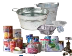
Empty cans, small metal items