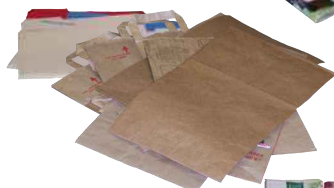
Chipboard boxes, paper products, cartons