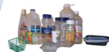
Empty plastic containers, small plastic items