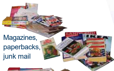
Magazines, paperbacks, junk mail