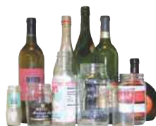
Empty glass containers